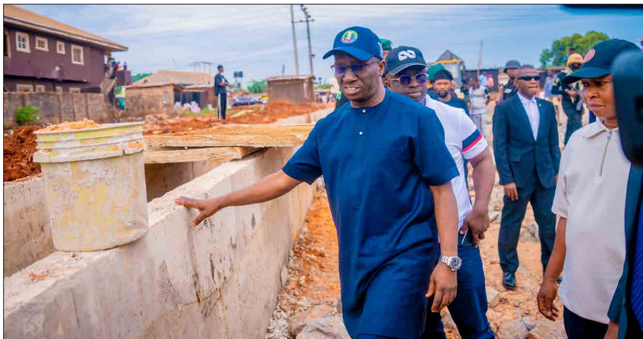
INSPECTING ONGOING ROAD PROJECTS:

She noted that the transformation underway has already improved safety and renewed confidence among residents.