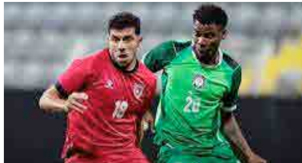
JORDAN VS NIGERIA MATCH

Nigeria thought they had restored parity just six minutes later when Raphael Onyedika hammered home a clever cut-back from Moses Simon, but the strike was controversially ruled out by the officials. Undeterred, the Super Eagles equalized in the 30th minute. Captain for the night, Moses Simon, celebrating a landmark 97th appearance showcased his predatory instincts yet again. After Ademola Lookman's initial effort was blocked, the Paris FC forward reacted quickest to slot home with a delightful left-footed finish, marking his second goal in as many games this month.