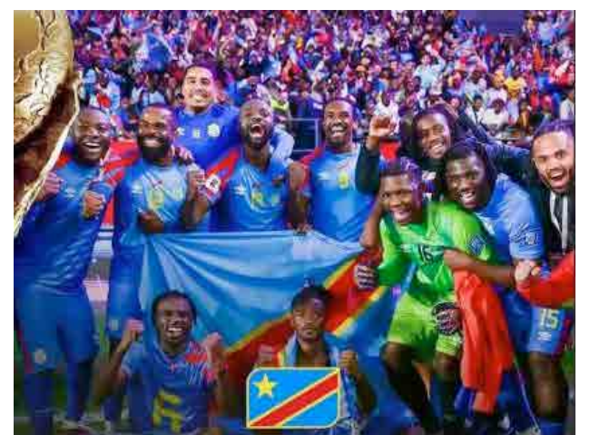
THE DEMOCRATIC REPUBLIC OF CONGO CELEBRATING

They have been drawn in Group K alongside Portugal, Uzbekistan and Colombia, and will open their campaign against Portugal on June 17 in Houston, Texas