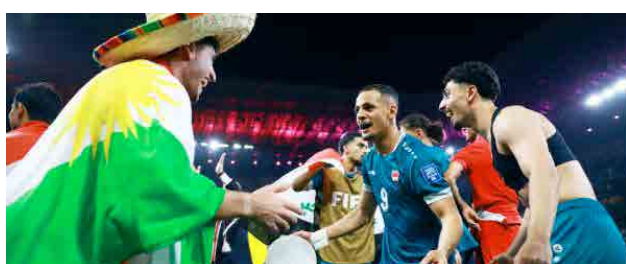
IRAQ PLAYERS CELEBRATING

Iraq defeated Bolivia 2-1 to qualify for the FIFA World Cup 2026, ending a 30-year absence from football's biggest stage.