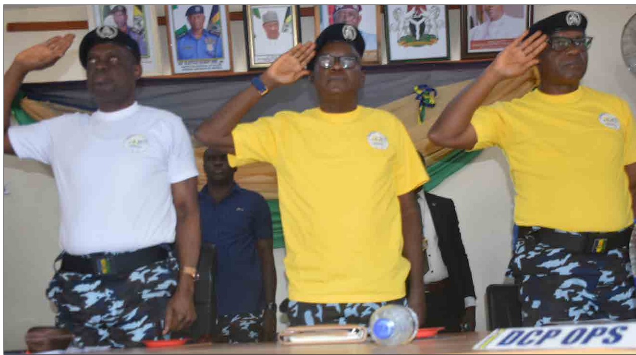
2026 NATIONAL POLICE DAY:

"A healthy population is essential for national productivity and economic growth. Nigerians must prioritise their health before illness forces them to," he added.