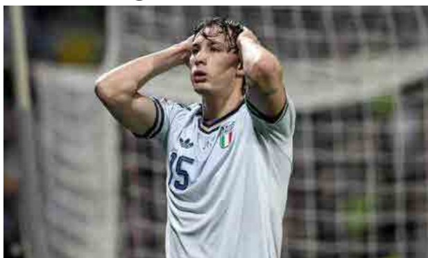
ITALY PLAYERS AFTER DISQUALIFY FROM THE WORLD CUP

The contest was ultimately settled from the penalty spot, where Italy faltered. Misses by Esposito and Bryan Cristante proved costly, as Bosnia converted all their kicks to seal qualification and complete a remarkable comeback after falling behind early.