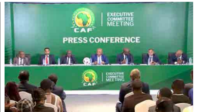
SAFA EXECUTIVE MEMBERS