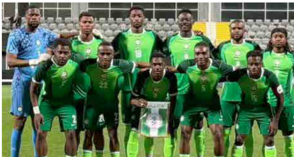
SUPER EAGLES OF NIGERIA

The absence of the Super Eagles, under the guidance of head coach Eric Chelle, represents a significant setback for a nation with a rich football pedigree and high expectations on the global stage.