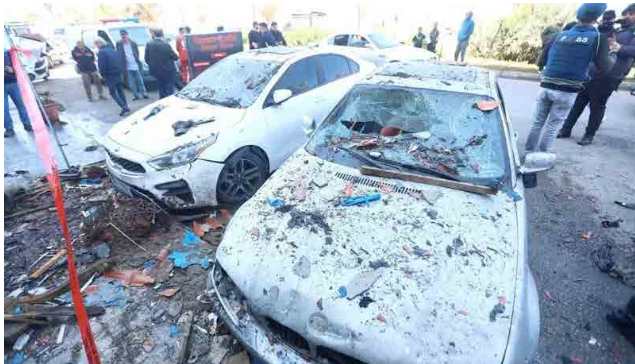
STRIKE SOUTHERN LEBANON:

Sirens sounded in Israel shortly after Trump's announcement, with the Israel Defense Forces saying they were intercepting missiles launched from Iran.