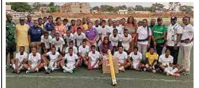
OLYMPAFRICA CENTRE TEAM

The groundbreaking ceremony for the Olympic Residential Estate Project is sched-