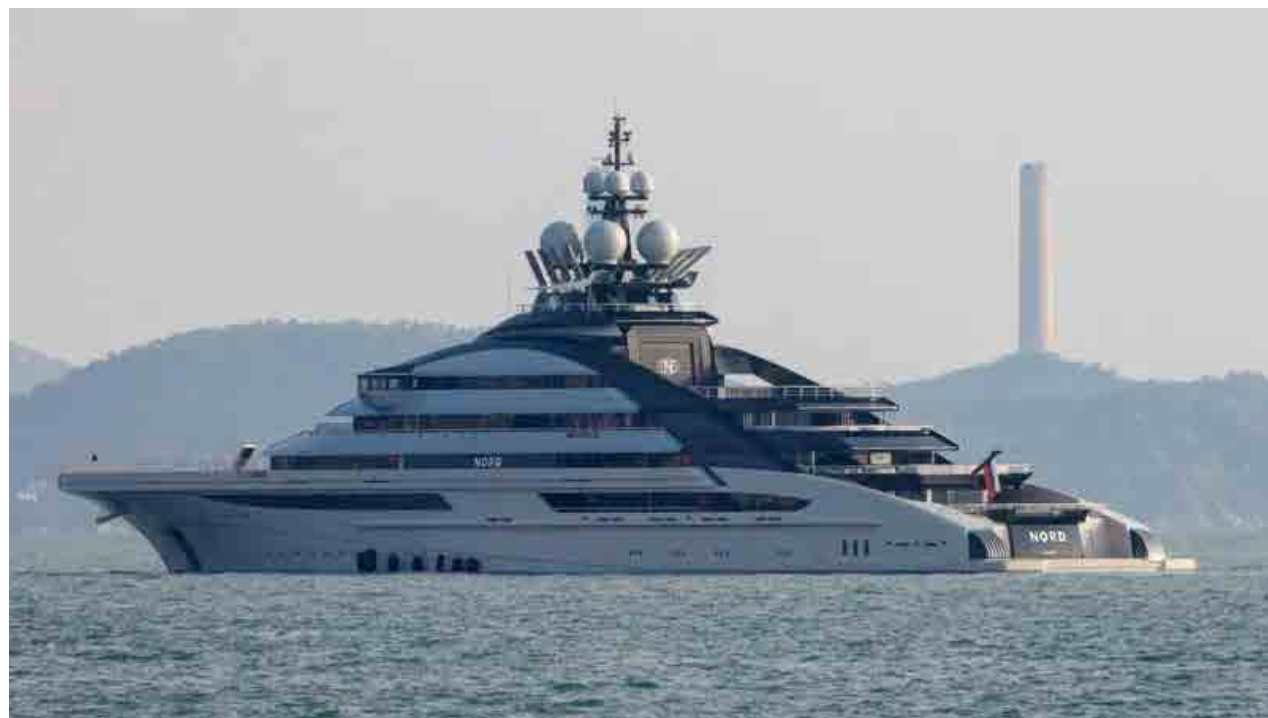
MULTI-DECK LUXURY BOAT:

Maritime traffic through the Gulf channel is currently at a fraction of pre-war levels.