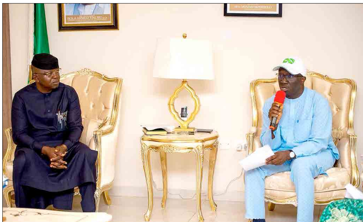
A COURTESY VISIT:

"Nigerians don't even know which party is the opposition. Threats don't win elections but serious minded mobilisation can make people win," the chairman said.