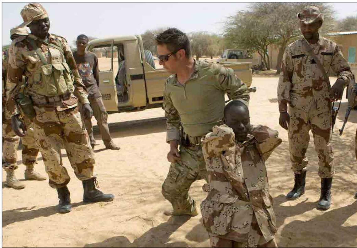
US military and Nigerian military

4. The Election-Year Paradox: President Biden’s second-term doctrine is “burden-sharing.” Translation: America will still lead, but NATO, Japan, and Gulf allies must pay more. Donald Trump, leading GOP polls for 2028, campaigns on “no more blank checks.” U.S. defence budget hit $905bn for FY2026, yet domestic pressure to focus on the border and