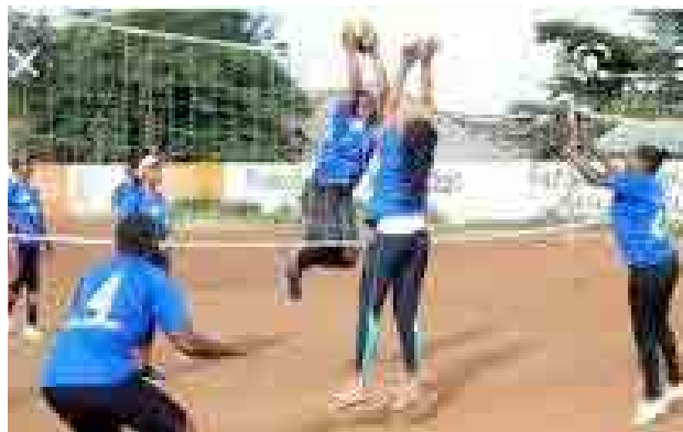
NIGERIA CATCHBALL PLAYERS

"The Federation remains committed to the development of Catchball both locally and internationally and hopes for a future where such decisions will not be necessary," he said