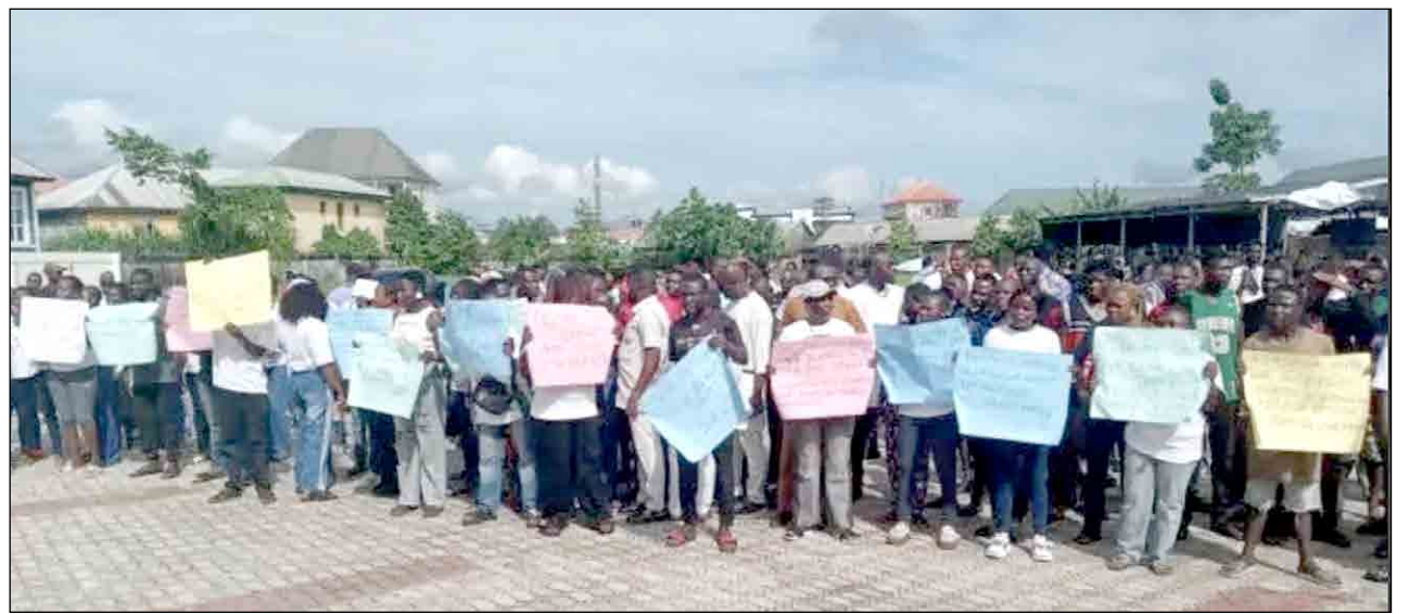
MARCH ON YENAGOA STREETS:

He further advised conservationists to value indigenous knowledge and local experience when designing ecological interventions.