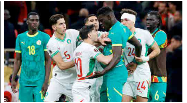
AFCON FINAL DISPUTE

Osimhen came within touching distance of Burak Yilmaz's club record of eight goals in a single Champions League season before Galatasaray's run was halted by eventual winners Liverpool.