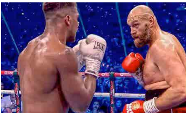
JOSHUA AND FURY

Riding on that victory, the self-styled "Gypsy King" immediately turned his attention to Joshua, issuing a public challenge and urging his compatriot to finally settle their long-running rivalry inside the ring. The call-out reignited widespread interest in a contest