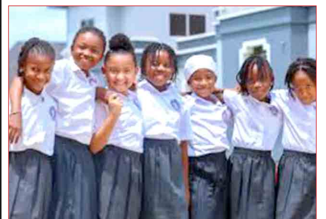
BRITISH SCHOOL STUDENT

"The school will also deepen its personalised learning approach, identifying students' strengths early and supporting them through tailored guidance and mentorship," she said.