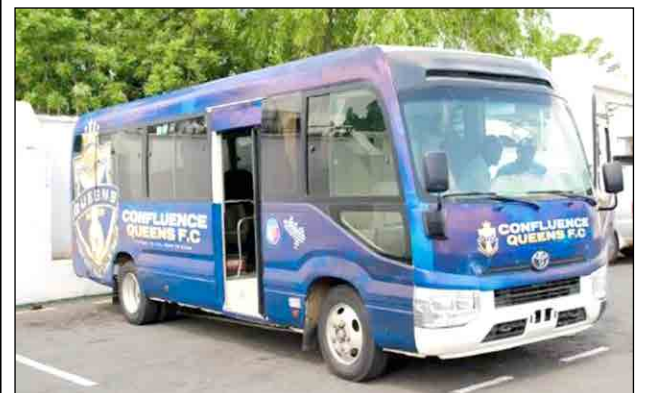
VEHICLE PRESENTED BY KOGI GOVT TO CONFLUENCE QUEENS FC

According to him, the initiative is aimed at improving the image of Kogi sports teams nationwide, expressing confidence that Confluence Queens would represent the state creditably.