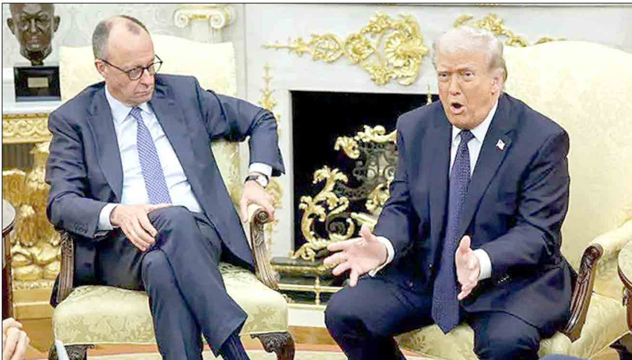
MEETING AT THE WHITE HOUSE:

On Wednesday the Kremlin announced it was paring back its annual military parade to mark Victory Day - the defeat of Nazi Germany in World War Two, on 9 May - due to what it said was the "terrorist threat" from Ukraine.