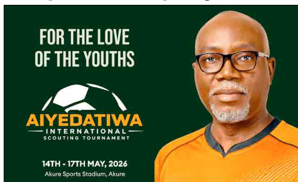
ONDO STATE GOVERNOR AIYEDATIWA