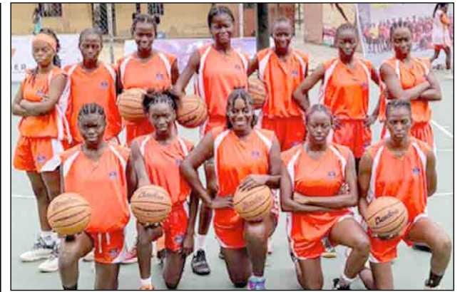
SHO'S FOUNDATION JUNIOR ELITE BASKETBALL