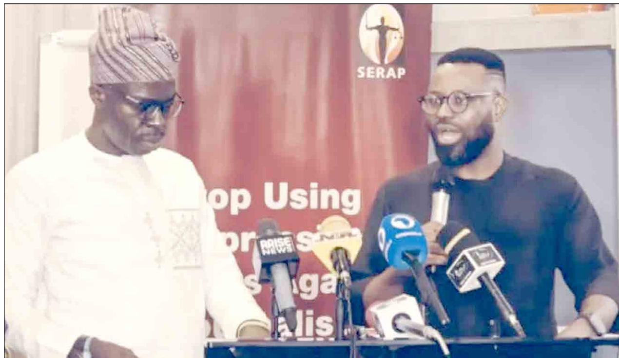
A JOINT NEWS CONFERENCE:

According to him, the Leadership Selection Committee is an ad hoc body constituted by the National Executive Committee (NEC) and had completed its assignment in 2023, after which it was dissolved.