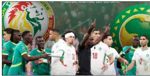
MOROCCO AND SENEGAL

The federation said the submission was intended to strengthen the legitimacy of Morocco's legal position while countering allegations of procedural irregularities that could influence the CAS proceedings.