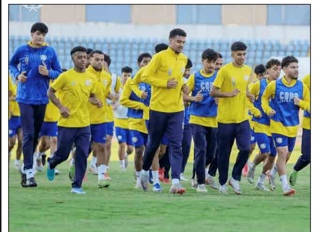
EGYPTIAN GIANTS ISMAILY SC

Their relegation has sparked emotional reactions among supporters and football followers across Africa, bringing an end to the club's long stay in the Egyptian top flight.