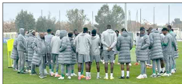
SUPER EAGLES OF NIGERIA

The tournament is expected to provide Zimbabwe's technical team with an important opportunity to evaluate player combinations and assess both locally-based and foreign-based talent ahead of future international commitments.