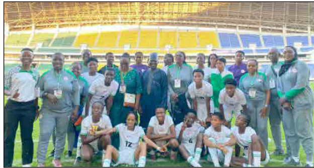
FALCONETS OF NIGERIA

Nigeria's Falconets, one of the tournament's ever-present teams, have been placed in Pot 2 alongside the United States,