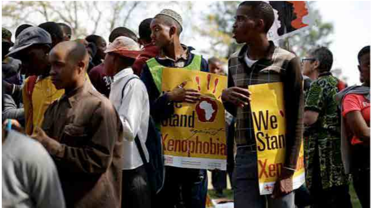
MARCH AGAINST XENOPHOBIC:

The Department of Home Affairs welcomed the judgment, describing it as a significant victory against abuse of the asylum system.