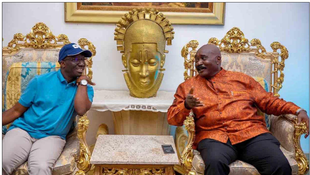
A FELICITATION VISIT:

Edo State Governor, Senator Monday Okpebholo (left) who led other prominent sons of Edo State on a felicitation visit to former Governor, Chief Lucky Igbinedion, at his Benin City residence to celebrate and honour him (Igbinedion) on his 69th birthday.