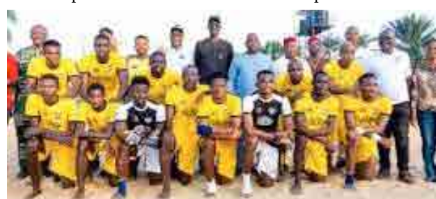
NIGERIA BEACH SOCCER PLAYERS

The opening round also featured matches involving Kebbi Fishers BSC against BAM Projects BSC, Anambra Warriors BSC versus Kada BSC, and Jigawa Golden Stars BSC against Kada BSC.