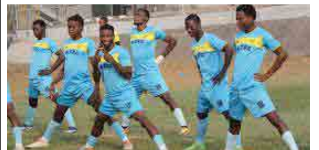
ABA SOUTH GRASSROOT FOOTBALL

He called on government at all levels to look into the problems of grassroots football and ensure that youths are engaged during long vacations.