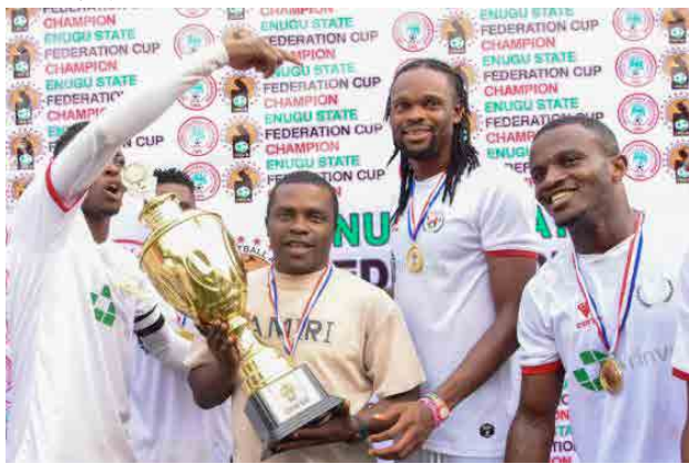
RANGERS FEDERATION CUP

The president federation cup fixture offers a rare square off for two giants, it's scheduled for June 1, 2026, with both sides expected to battle for a place in the next stage despite the growing off-field tension surrounding the tie