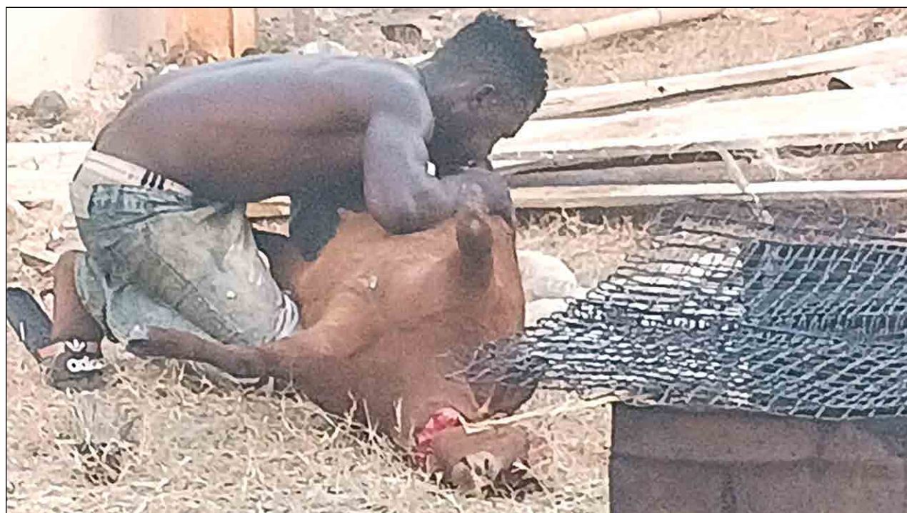
BLOWING UP A GOAT:

Omo-Agege maintained that his political focus remains on attracting development and ensuring effective representation for Delta Central and Delta State, stressing that he would continue to pursue those objectives outside the APC.