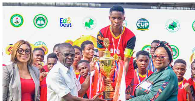
BENIN TECHNICAL COLLEGE WITH EDO STATE GOVERNOR'S CUP