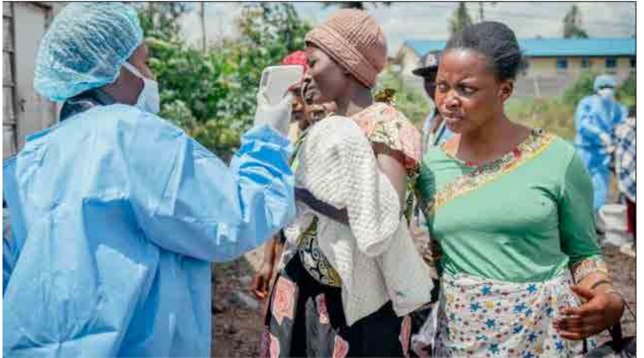
EBOLA-HIT DR CONGO:

They added this includes targeting the use of social media by smuggling gangs, maximising intelligence sharing and using new technologies to their monitor borders.