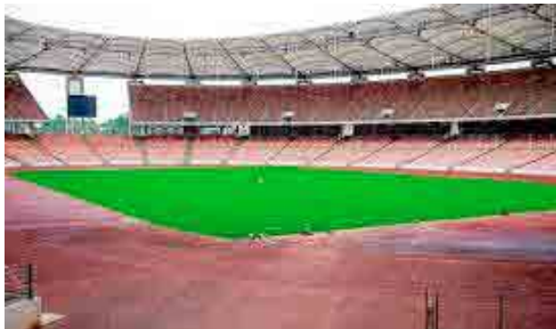
MUDA LAWAL STADIUM

Muda Lawal, who hailed from Abeokuta, Ogun State, remains one of Nigeria's most celebrated football heroes. The former Green Eagles player was a central figure in Nigeria's historic 1980 Africa Cup of Nations triumph, where he scored in the memorable 3-0 victory over Algeria to secure the country's first-ever continental title.