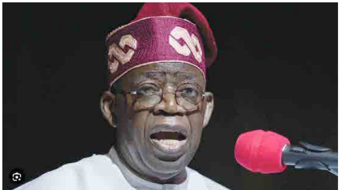
PRESIDENT BOLA TINUBU

Tinubu's gamble is clear: endure short-term pain for long-term gain. Whether Nigerians will wait is the real political question heading to 2027.