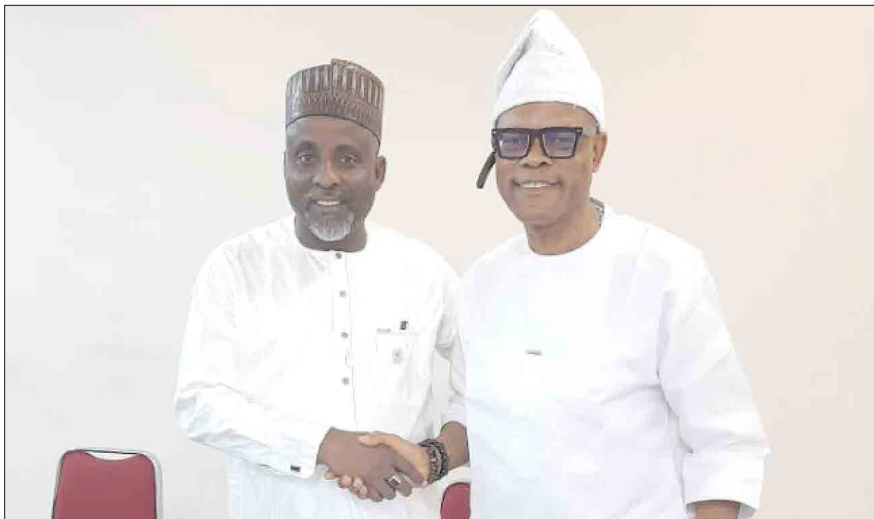
NUJ'S NEC MEETING: