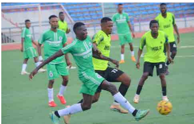
WESTGATE FC AND AMANDA FC