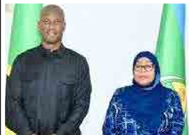
DIDIER DROGBA AND TANZANIAN PRESIDENT SAMIA SULUHU HASSAN

Tanzania is set to co-host the 2027 AFCON alongside Kenya and Uganda, and the potential appointment of the Chelsea legend is seen as a strategic step in strengthening preparations for the prestigious continental showpiece