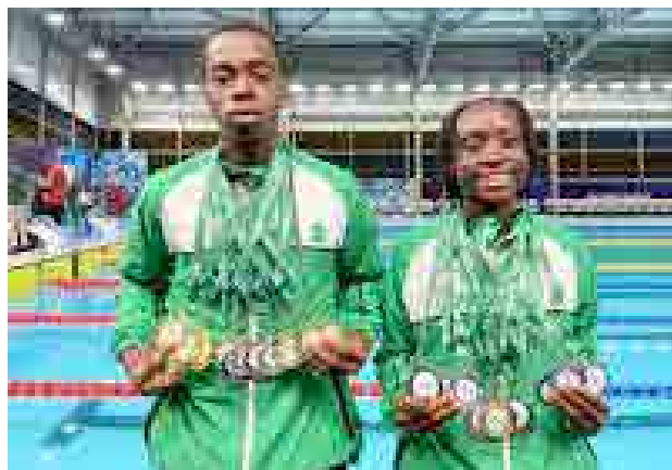
THE NIGERIA AQUATICS CHAMPIONS

Team Nigeria remains focused and motivated as the championships continue, with several events still ahead and strong medal prospects in sight.