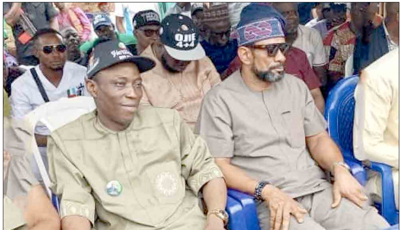
FLAG OFF OF RE-ELECTION CAMPAIGN:

"We once again appeal to all eligible citizens to present themselves for registration and to play their part in strengthening the foundation of our electoral process," the statement added