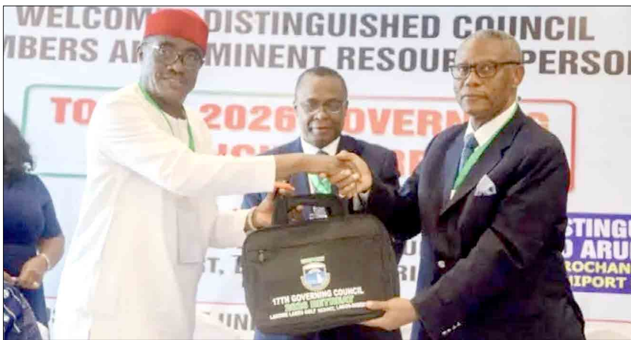
RECEIVES A SOUVENIR:

Ologun also expressed concern over rising public distrust in democratic institutions, particularly the judiciary and electoral system.