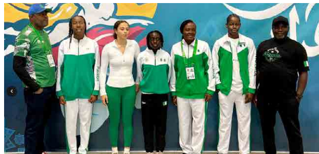
TEAM NIGERIA IN ACCRA, GHANA

The friendly tournament is expected to offer valuable competitive exposure for the Nigerian boxers as they intensify preparations for the multi-sport event in Scotland.