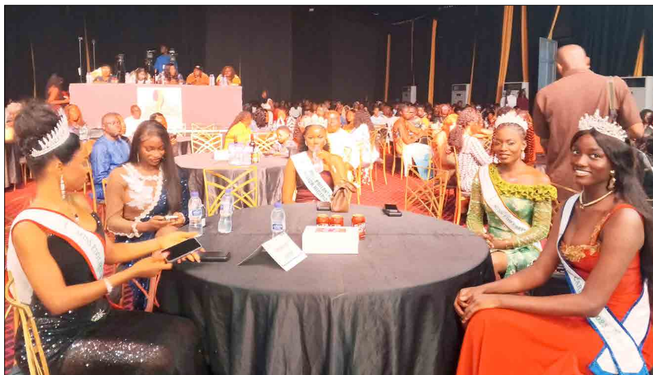
MISS EDO INTERNATIONAL PAGEANTRY:

"I send warm felicitations of the federal government to all Muslim faithful in Nigeria and in the diaspora," Tunji-Ojo said.