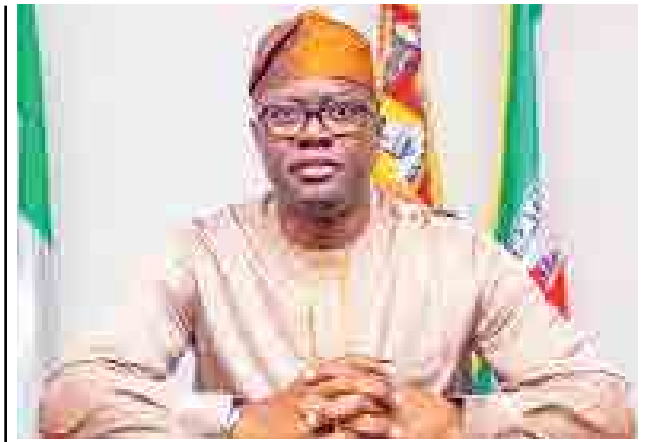
GOV. SEYI MAKINDE

The Portuguese playmaker ended the season with 21 assists and 9 goals, making it a total of 30 goal contribution for the Red Devils.