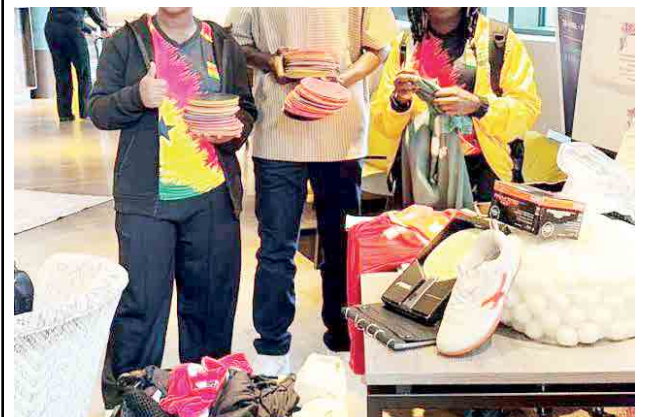
NIGERIAN TABLE TENNIS EQUIPMENT

"If they maintain their passion and train properly, I hope to bring them to China for camps and tournaments.