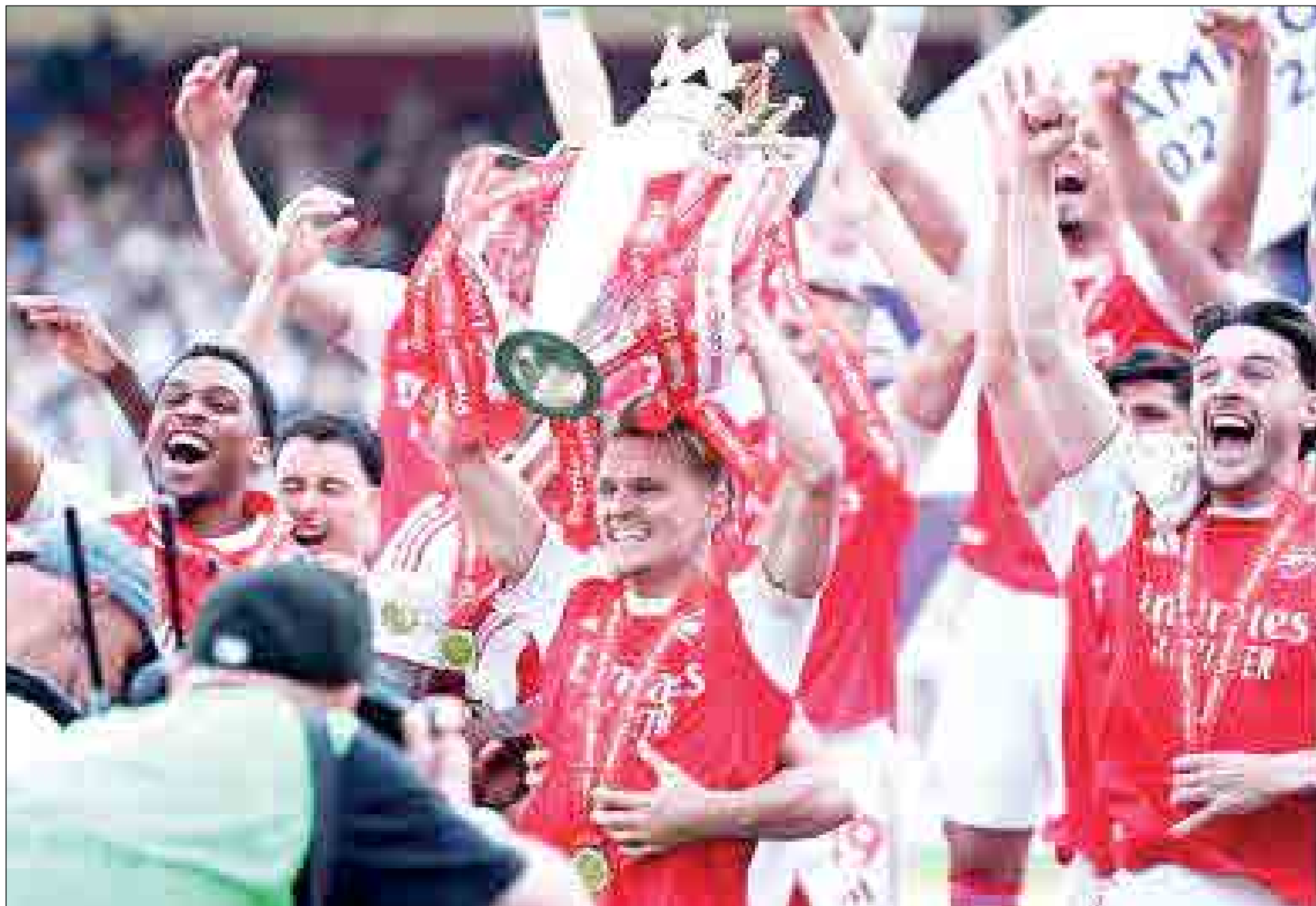
ARSENAL THE ENGLISH PREMIER LEAGUE CHAMPION (EPL) 2025/26 SEASON