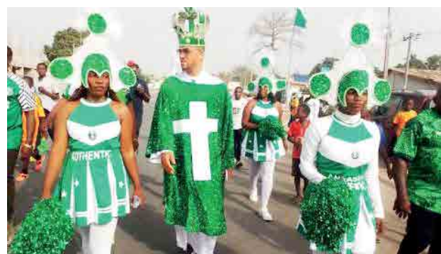
NIGERIA FOOTBALL AND ALLIED SPORTS SUPPORTERS CLUB

The Authentic Nigeria Football and Allied Sports Supporters Club (ANFASSC) has arrived in London ahead of the 2026 Unity Cup, where Nigeria's Super Eagles will be aiming to successfully defend the title they won last year.