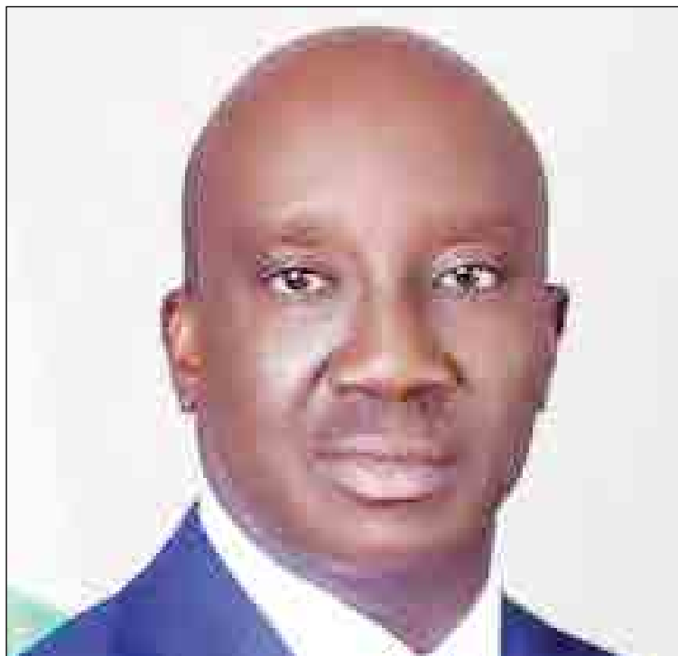
SENATOR MONDAY OKPEBHOLO

The Okpebholo administration has prioritized road infrastructure across Edo State since assuming office, with several ongoing projects aimed at opening up rural and peri-urban communities to economic activities. The Evbukhu Community Road project is one of the key interventions in Oredo LGA.