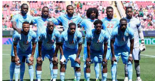
DR CONGO TEAM

Following the discussions, both FECOFA and FIFA reportedly agreed that the players and technical staff had complied with the health regulations imposed