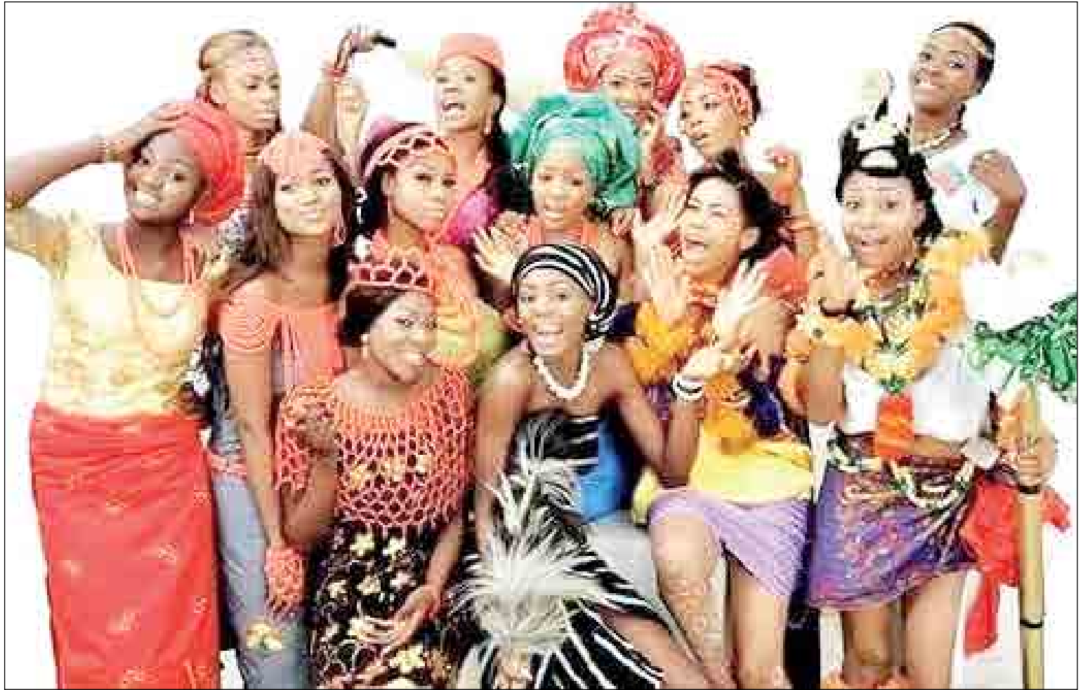
MAMA PUT FOOD

Speaking English in public spaces is associated with being civilized, elite, and wealthy. Even private schools emphasize English heavily. The native languages are most times treated as inferior. In most schools, native languages are treated as secondary subjects. Most young people even feel that foreign languages are more respectable than African languages. There is an ideology in Nigeria that speaking English guarantees better opportunities, but we forget that language is not only communication; it