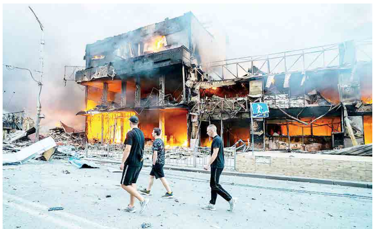
BALLISTIC MISSILE STRIKES:

For Iranian players, the move eases logistics. For FIFA, it tests its ability to keep politics out of football ahead of the expanded 48-team tournament.