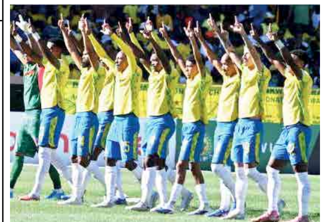
SOUTH AFRICA'S MAMELODI SUNDOWNS

The hosts were awarded a penalty via VAR review in the 37th minute when Divine Lunga was caught out by Slim and fouled the ASFAR no.10 in trying to recover. Hrimat took the spot kick and coolly converted to make it 1-0 in the 40th minute and 1-1 on aggregate.