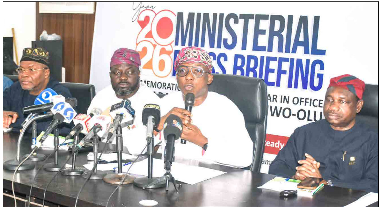
2026 LAGOS STATE MINISTERIAL NEWS CONFERENCE:

By Friday, 2,100 children had been screened. 180 tested AS, 22 SS. Parents are referred to clinics for follow-up.