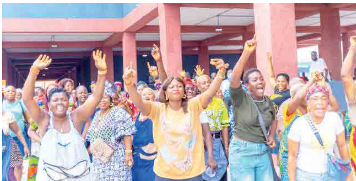
OBA MARKET WOMAN

highly competitive environments where space determines visibility, customer access, and daily income. For displaced traders, uncertainty over allocation and relocation often creates tension and fear of exclusion.