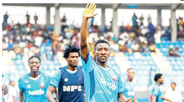
REMO STARS PLAYER

Former Nigeria Premier Football League champions Remo Stars have confirmed their relegation to the lower division.