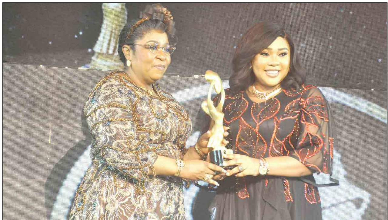
MOST EGALITARIAN FIRST LADY OF THE YEAR:

He held that INEC lacked the statutory power to fix or prescribe the timeframe within which political parties must conduct their primaries for the nomination of candidates for the 2027 general elections.