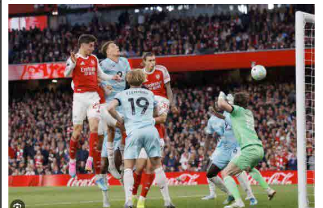
ARSENAL AND BURNLEY MATCH

Should City win away to Bournemouth, Arsenal will need to beat Crystal Palace away from home on the final day of the league to be confirmed champions.