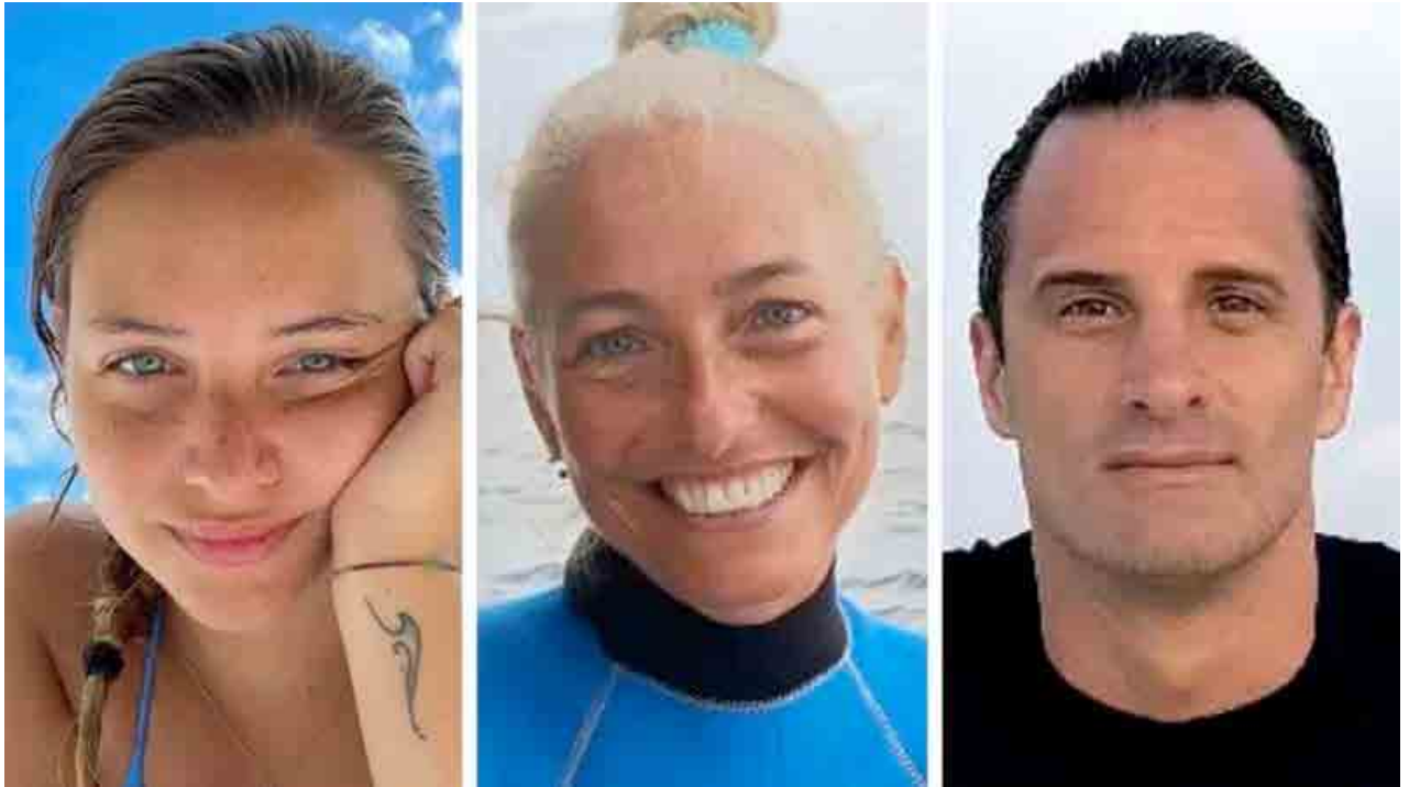
MALDIVES CAVE VICTIM:

Nasa's satellite-based wildfire monitoring platform shows the fire has moved north-east over the weekend and now appears to be spreading inland.