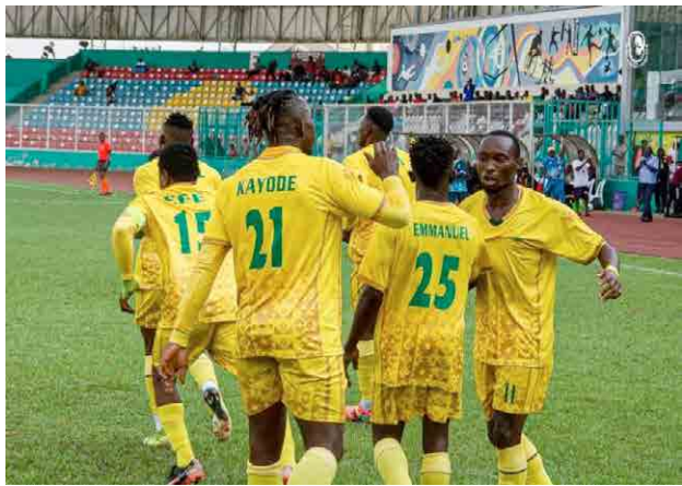
BENDEL INSURANCE FC CELEBRATE

Insurance FC will return to Benin immediately to prepare for the last match of the outgoing season of the Nigeria Premier Football League (NPFL). They currently occupy the fifth position on the table of the Nigeria Premier Football League (NPFL) with 55 points and will be host to relegation threatened Remo Stars in the last fixtures of the season on Sunday, May 24.