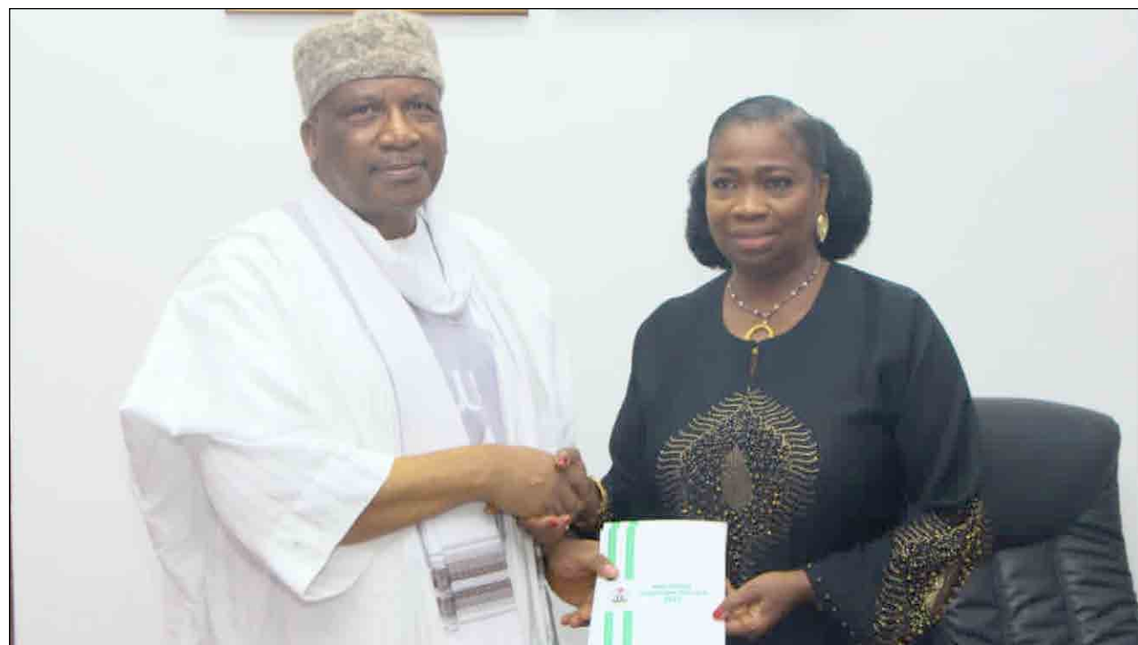
A COURTESY VISIT:

L-R: Nigeria's Ambassador-designate to China, Gen. Abdul-Rahman Dambazau (rtd), receiving a National Diaspora Policy document from the Chairman/CEO, Nigerians in Diaspora Commission (NIDCOM), Hon. Abike Dabiri-Erewa, during a courtesy visit to the NIDCOM office in Abuja yesterday.