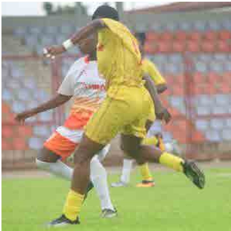
EDO QUEENS VS GHETTO TIGERS QUEENS