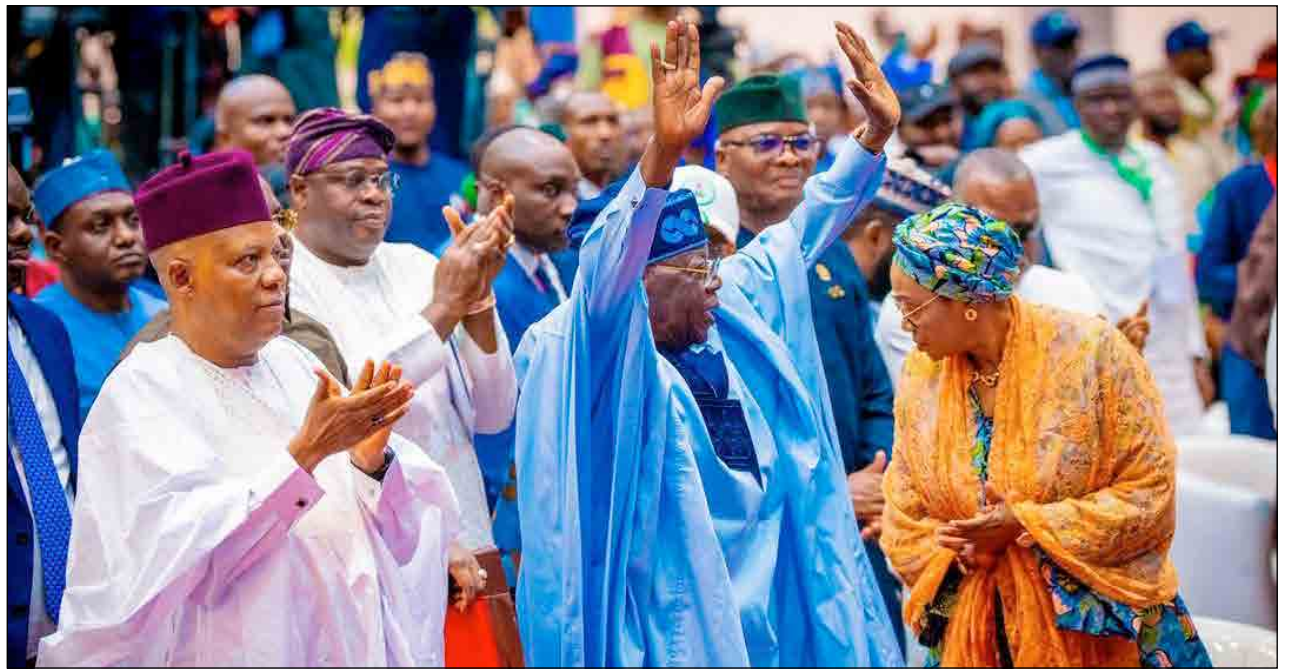
PRIMARY ELECTION COLLATION CENTRE:

gestion at arrival halls during peak periods, baggage handling delays, damaged taxiway infrastructure, deteriorating road conditions and access control challenges at ramp entrances.