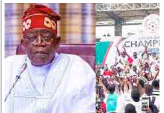
PRESIDENT BOLA TINUBU

"This victory is an obvious fruit of his administration's investments in youth and sports in the state. I commend him," the President said.