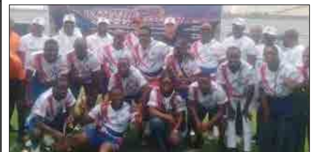
TEAM LAGOS STATE

Swart noted Nigeria's influence in global sports in spite of the Super Eagles missing the ongoing World Cup.