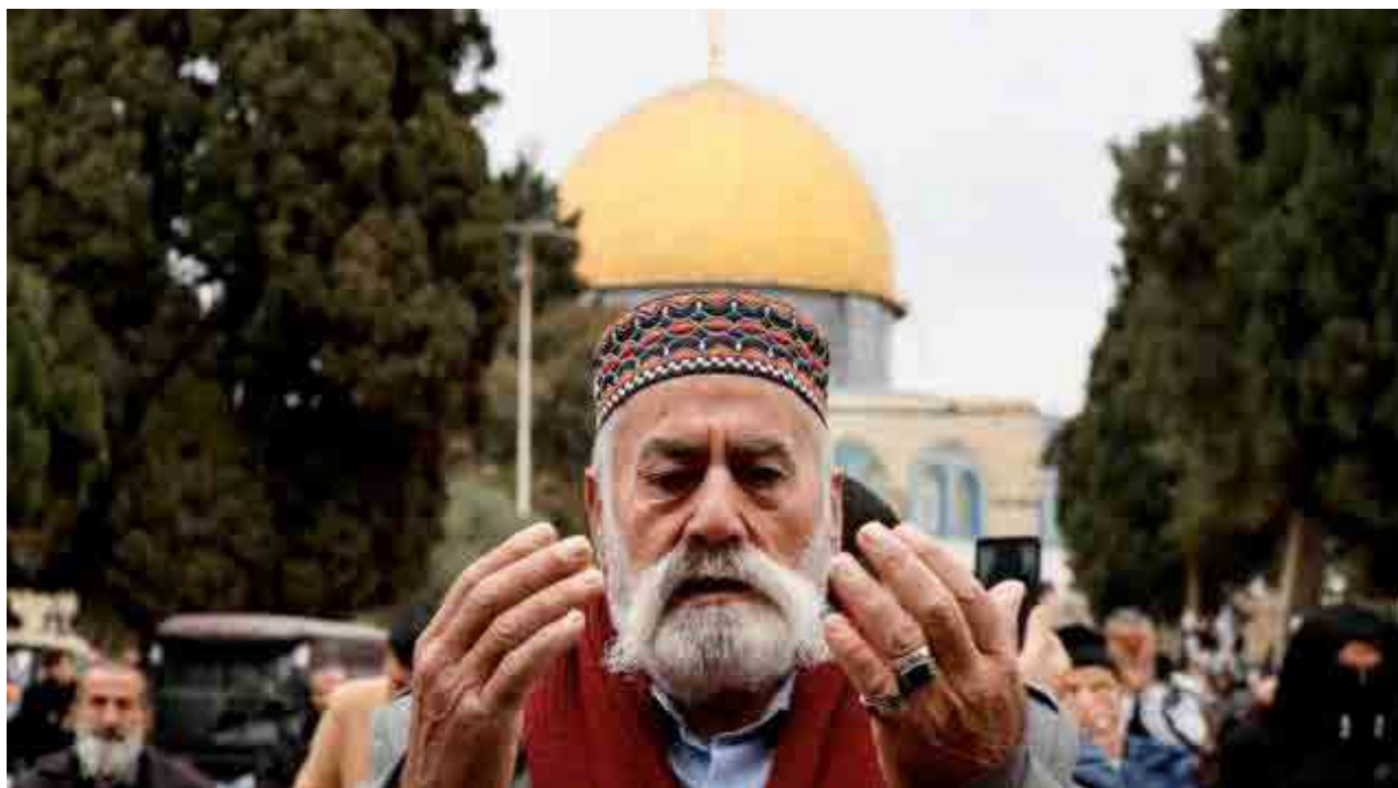
PLAYERS AT AL-AQSA MOSQUE:

"We didn't pay for it like Obama did. He paid billions of dollars," Trump said on Tuesday.