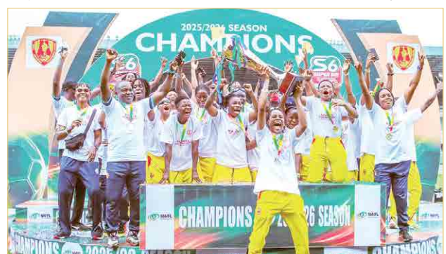
EDO QUEENS FOOTBALL CLUB CELEBRATE

The Special Adviser said his support for the team aligns with