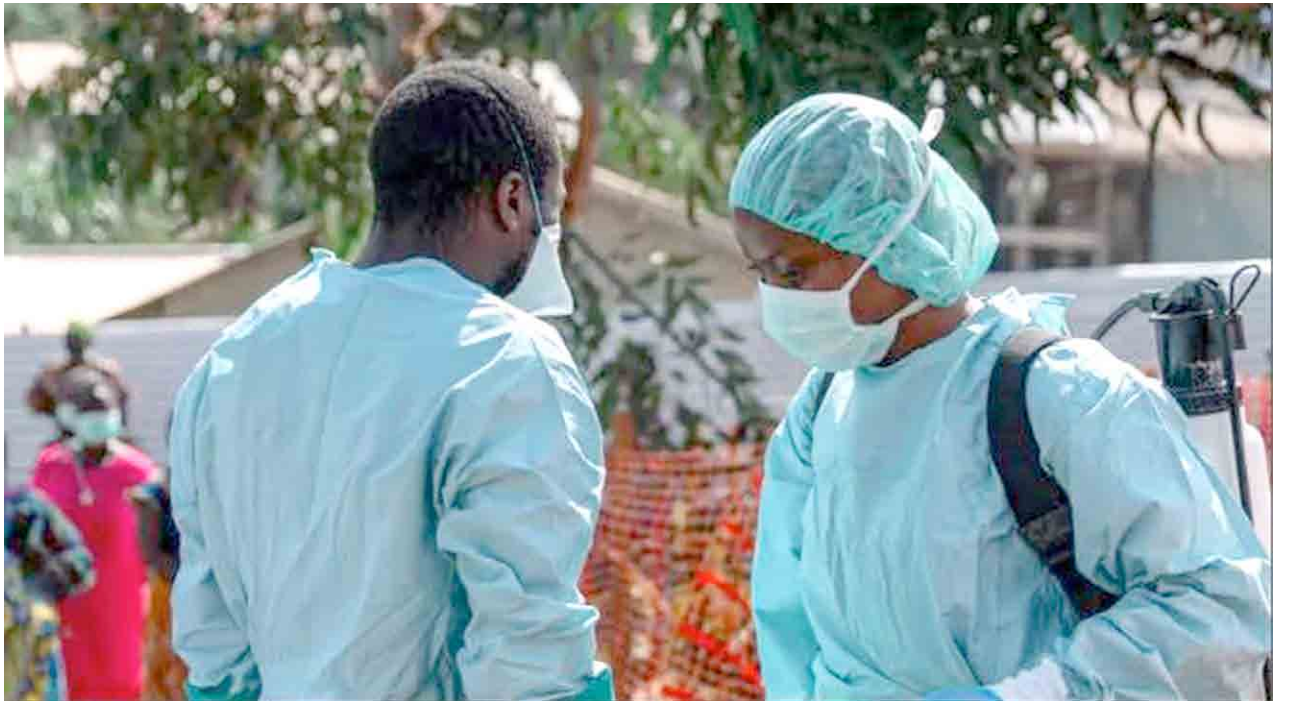
DR CONGO EBOLA:

Bystanders help rescue people at the site of the plane crash.