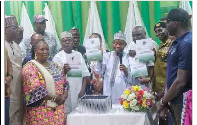
THE NIGERIA OLYMPIC COMMITTEE (NOC) HAS UNVEILED THE NIGERIA SAFEGUARDING IN SPORTS POLICY