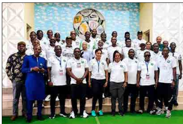
CAF B-LICENSE REFRESHER

"You can be in your state, and the course will be at your doorstep. We need to educate our grassroots coaches. That is the way to go for holistic development of the game," he added.