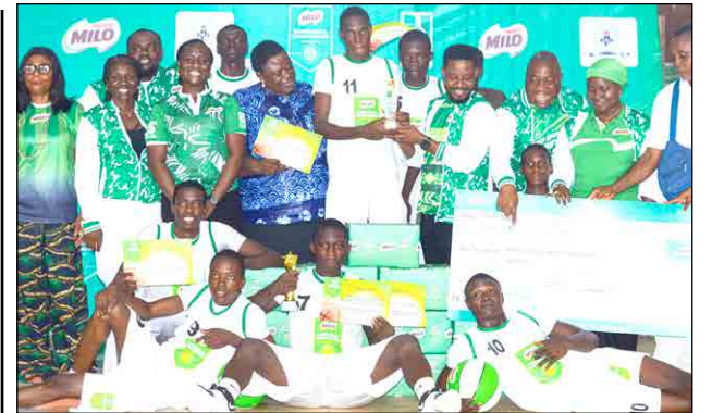
MILO BASKETBALL CHAMPIONS