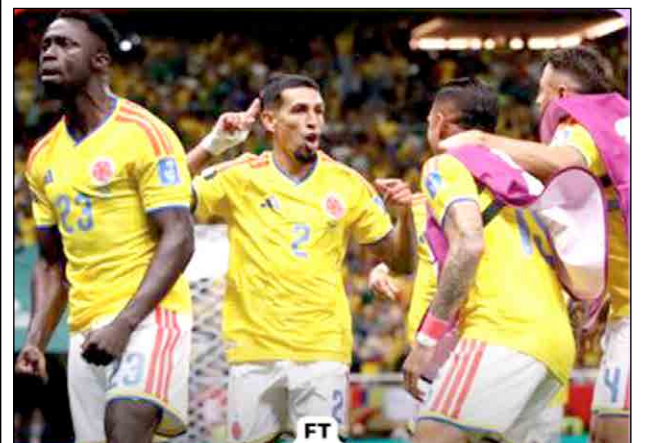
COLOMBIA PLAYERS CELEBRATE

The goal lifted the South Americans and forced DR Congo to attack in search of an equaliser.