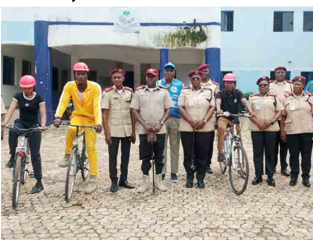
KADUNA FRSC CYCLING

"We have excelled in cycling in Kaduna and want more people to join the sport.