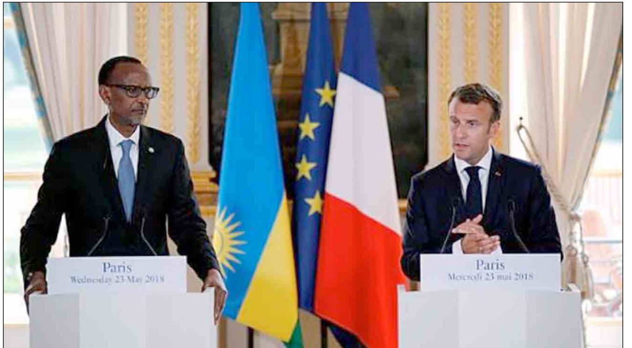
INAUGURATE PARIS MEMORIAL: