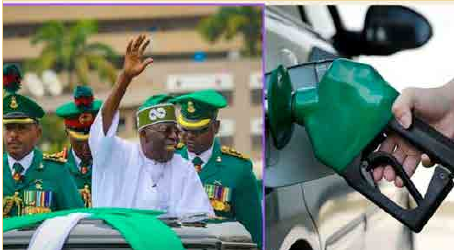
PRESIDENT BOLA AHMED TINUBU

Inflation Cooling: Headline inflation fell from 33.2% in March 2024 to 22.1% in April 2026. Food inflation is still high at 26%, but the trajectory is downward.