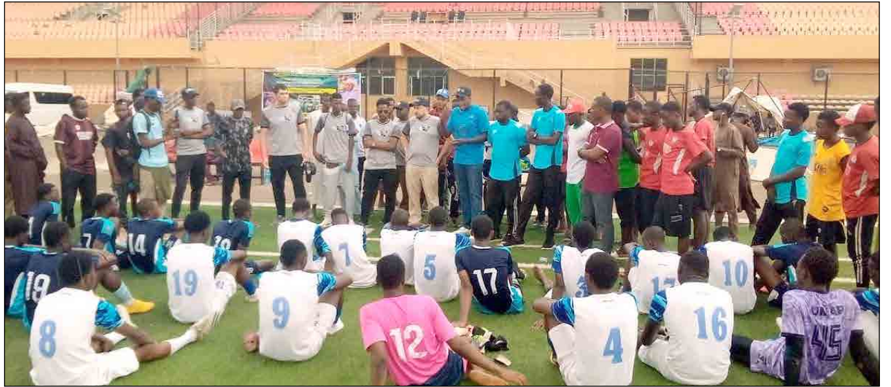
YOUNG FOOTBALLERS IN KATSINA STATE

many young footballers in Katsina of securing opportunities to play on the international stage.