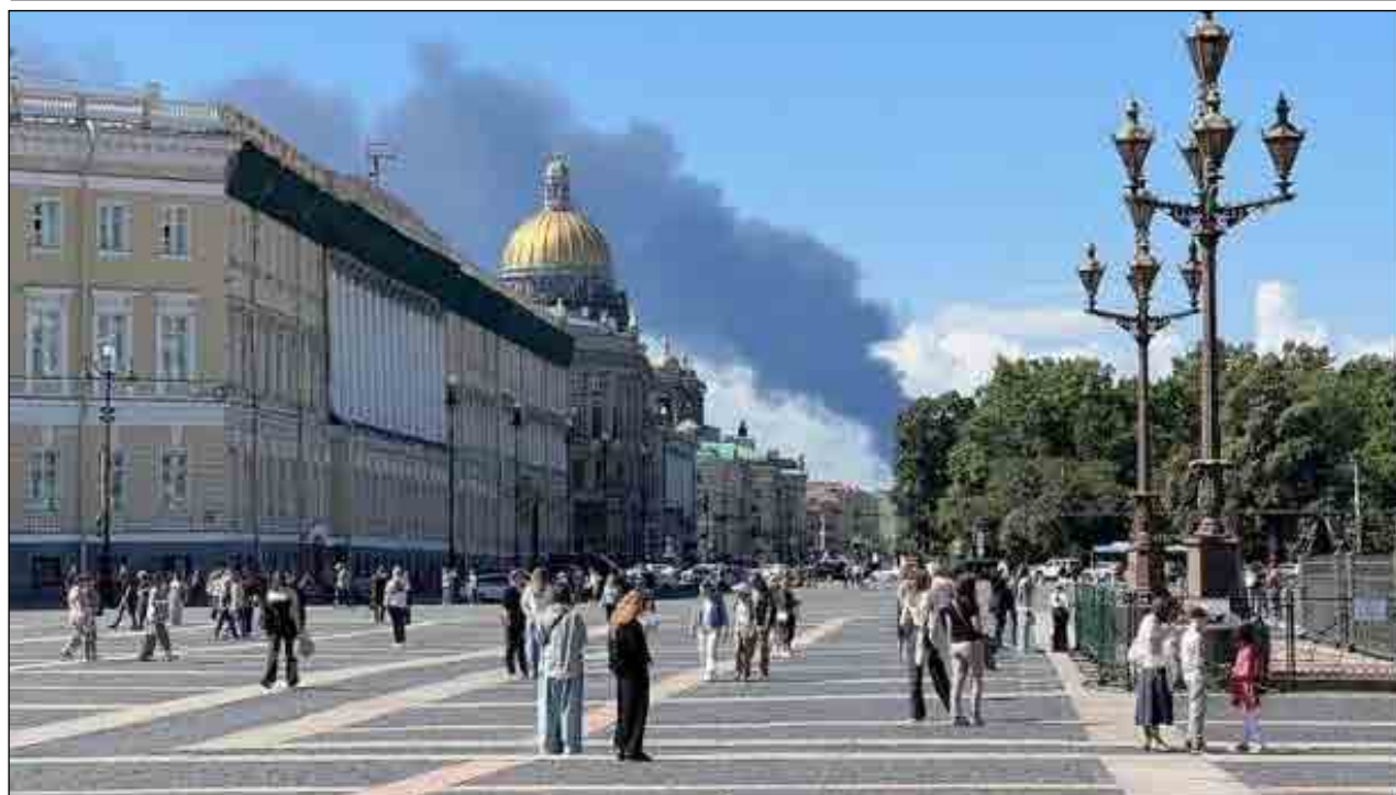
MAJOR ECONOMIC FORUM:

"We continue to engage regularly with the US administration as part of our negotiations, and have made clear the actions we're taking."