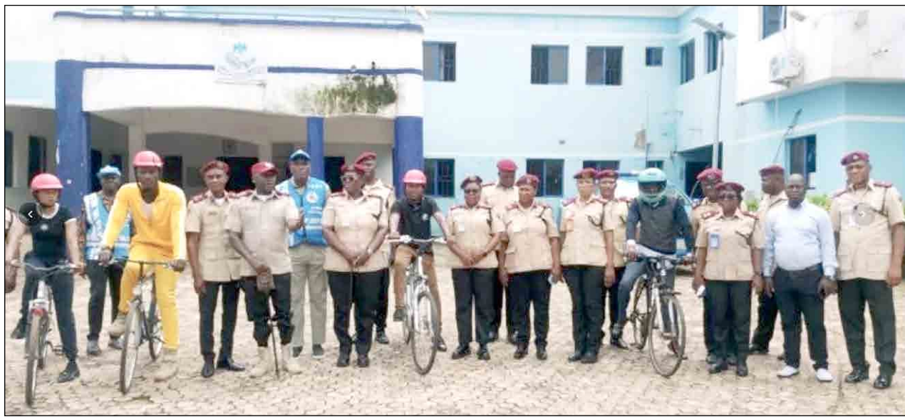
WORLD BICYCLES DAY:

He expressed optimism that with renewed efforts by the government and security agencies to tackle insecurity, road safety personnel would once again be able to operate freely in all parts of the country and effectively contribute to the reduction of traffic accidents and loss of lives on Nigerian roads.