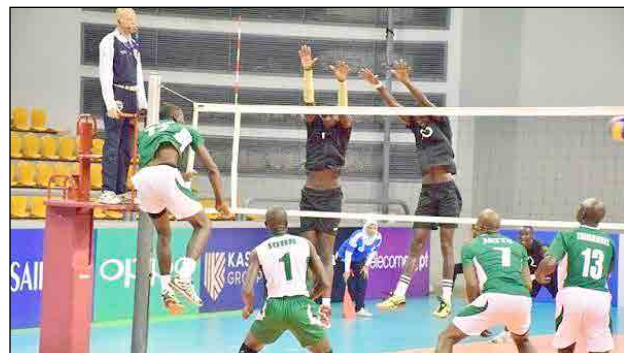
LIGHTS SPIKERS VOLLEYBALL CLUB

The championship began on May 23 and will run until June 5 at the Indoor Sports Hall of the Moshood Abiola National Stadium.