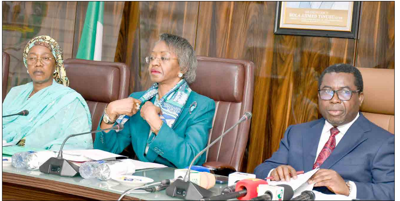
MEETING WITH POLITICAL PARTIES:

Efforts, he said, were ongoing to identify all injured and deceased persons for proper documentation and further action.