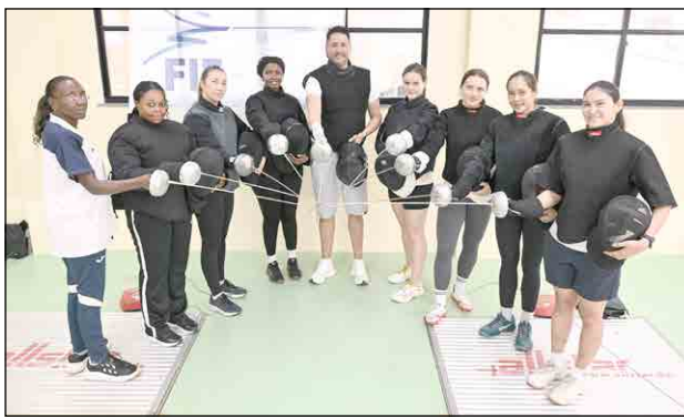
NIGERIA FENCING TEAM

"The sessions on career growth and leadership empha-