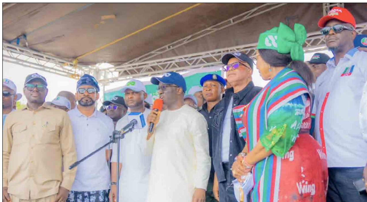
FLAG OFF OF CAMPAIGN: