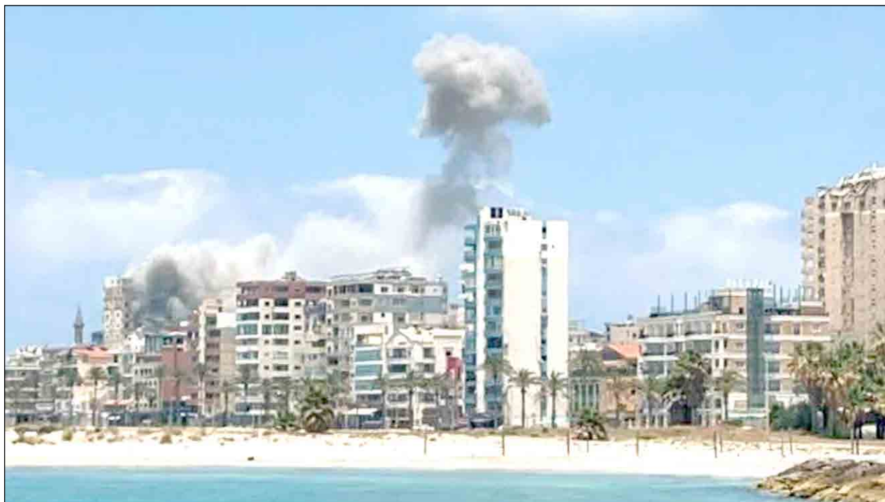
ISRAELI AIR STRIKES:

US President Donald Trump earlier told reporters the two crew members were "fine", and that a report into the incident would be issued later.