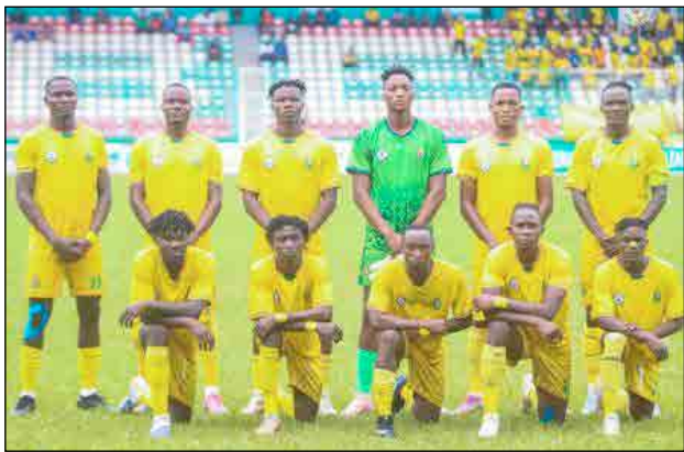
BENDEL INSURANCE FC

The players and coaches including the backroom staff are expected to return to work on