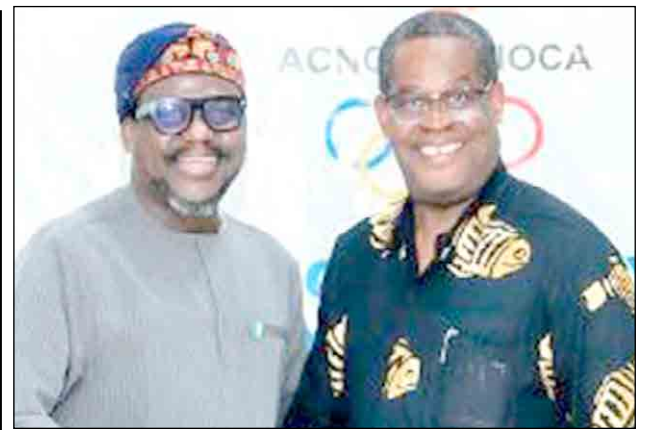
Association of National Olympic Committees of Africa (ANOCA) meeting on Tuesday.