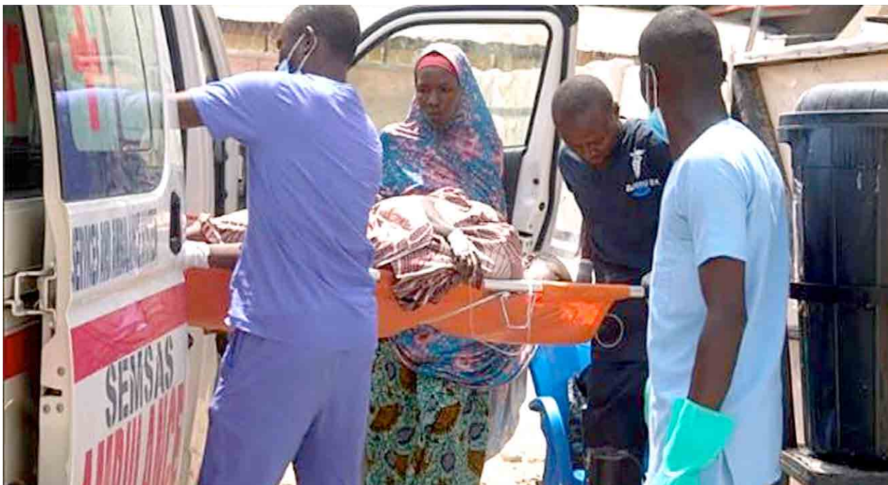
PATIENT SUFFERING FROM CHOLERA:

One woman said the markets had since been "deserted", while another told BBC Afghan that officers from the Ministry for Propagation of Virtue and Prevention of Vice, the so-called morality police, were checking cars and rickshaws for women wearing the hijab improperly.