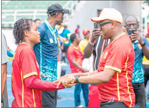
EDO QUEENS FC WITH THE EDO SPORTS COMMISSIONER