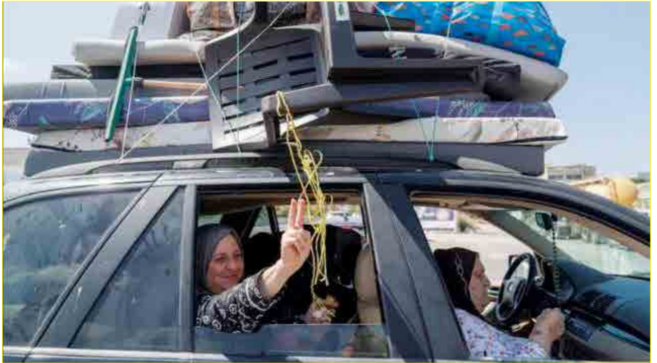
QUIET IN LEBANON:

For now, officials insist there has been no attempt to overthrow the government, describing the rumours as unfounded speculation rather than a genuine threat to the state.