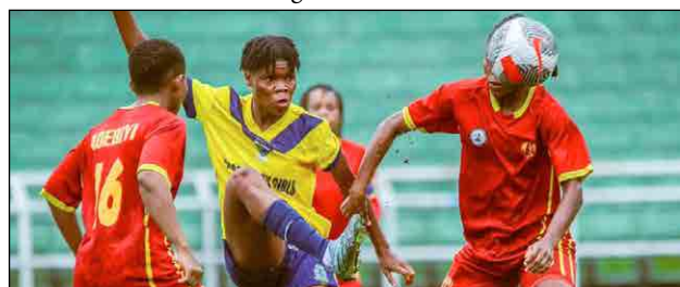
EDO QUEENS AT THE FINAL OF NWFL

The Sports Writers Association of Nigeria (SWAN), Edo State Chapter, has congratulated Edo Queens Football Club on their historic emergence as champions of the 2026 Nigeria Women Football League