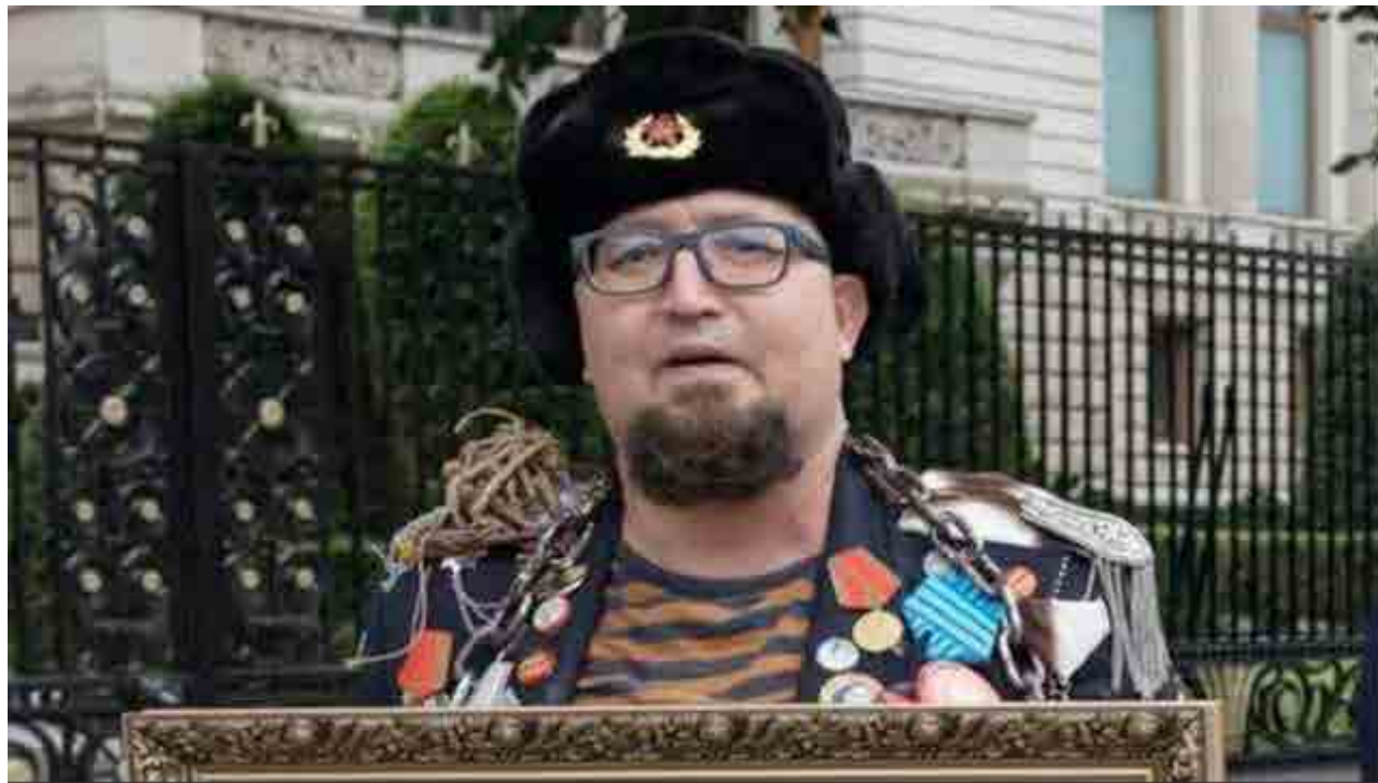
RUSSIAN ARTIST AND VOCAL CRITIC:

He had been carrying a painting caricaturing Putin and Soviet leader Joseph Stalin, as well as a Russian flag tied to his trousers that had been dragging along the road.