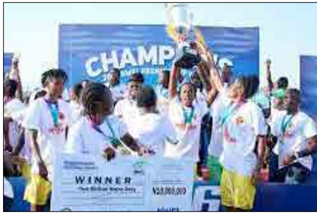
EDO QUEENS CELEBRATE WINNING NWFL TITLE

"As you celebrate this well-deserved championship, please know that you have inspired a new generation of young athletes across Edo State and beyond. We look forward to cheering you on as you carry this momentum into future competitions and continental campaigns." Congratulations once again, Champions!