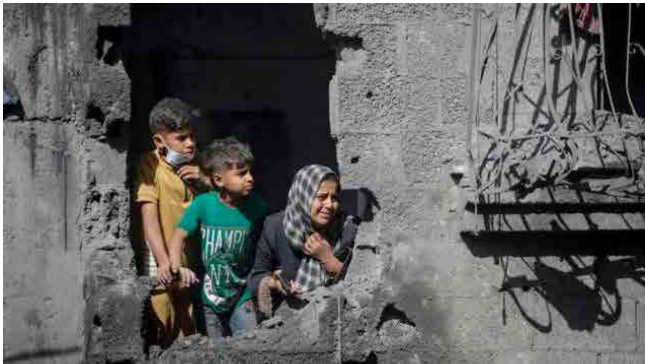
CHILDREN IN GAZA WAR:

De la Escriella has promised to co-operate more closely with the US in the fight against drug trafficking, saying that he plans to bomb drug-trafficking gangs and allow the US to have military bases inside Colombia.