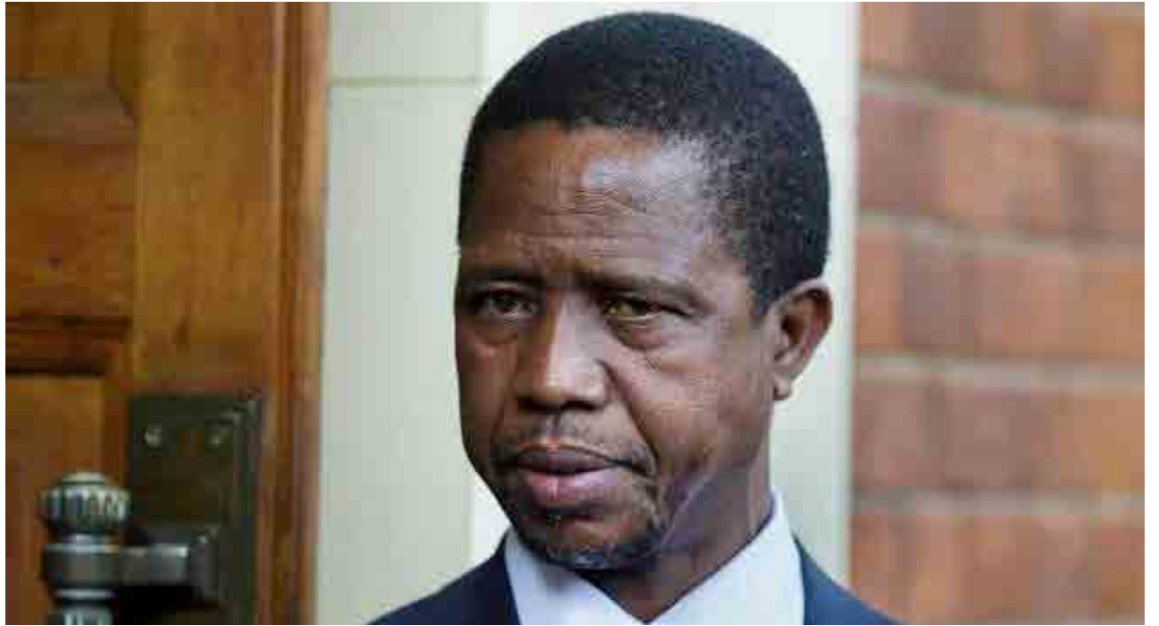
ZAMBIA'S FORMER PRESIDENT:

It said preparations for inter-party dialogue on election-related issues were progressing and would provide a platform for building consensus among political stakeholders.