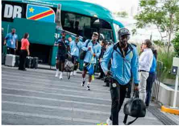
DR CONGO TEAM ARRIVED

DR Congo delegation have arrived in Mexico ahead of their second Group K fixture at the 2026 FIFA World