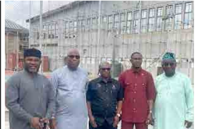
The Lagos State Sports Trust Fund (LSSTF) committee