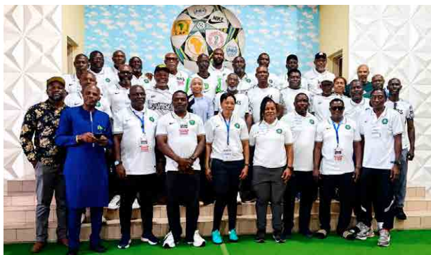
CAF A-LICENSE REFRESHER