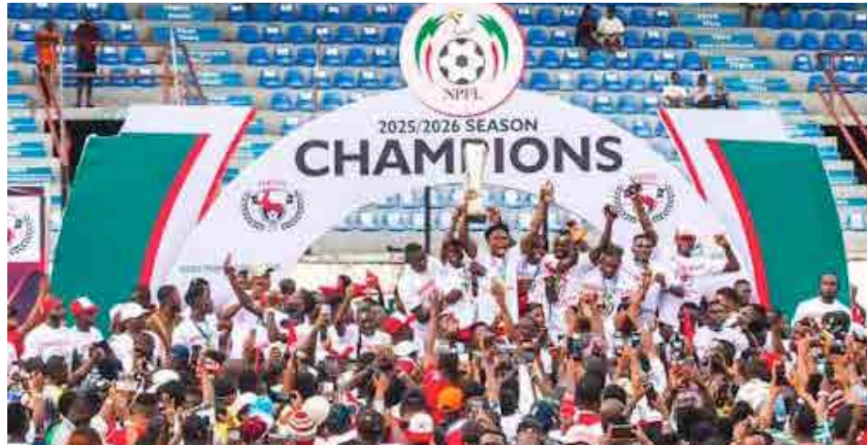
2025/2026 Nigeria Premier Football League NPFL Champions

The increased financial incentives are expected to boost competition among clubs while strengthening the overall profile of Nigerian domestic football. Note: Your original draft appears incomplete regarding the exact amount for the runners-up and third-placed team. If the runners-up are meant to receive N500 million or N5 million, I can revise the article accordingly, as there is a significant difference between the two.